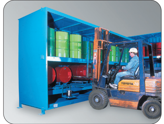
Combination of horizontal and vertical storage (rotating drum support and can support optional) - prices on request !