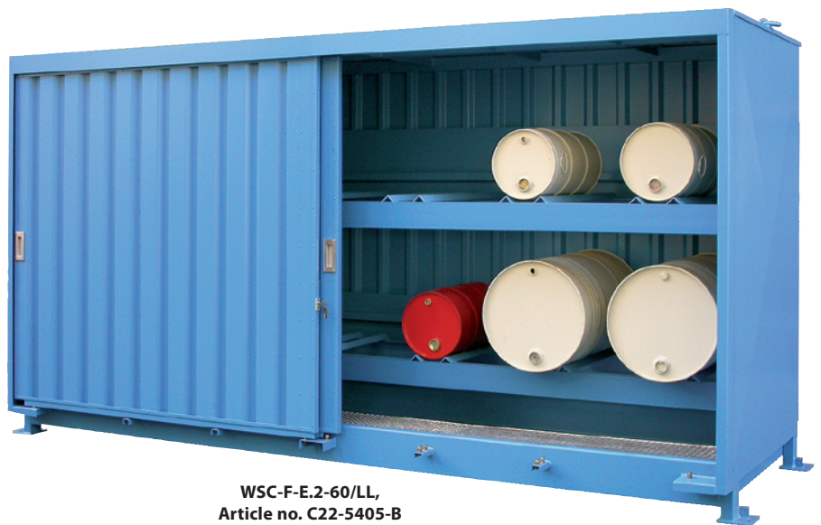
WSC-F-E.2-60/LL, Article no. C22-5405-B