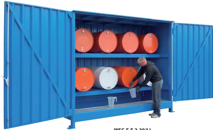
WSC-F-E.2-30/LL, Article no. C22-5401-B