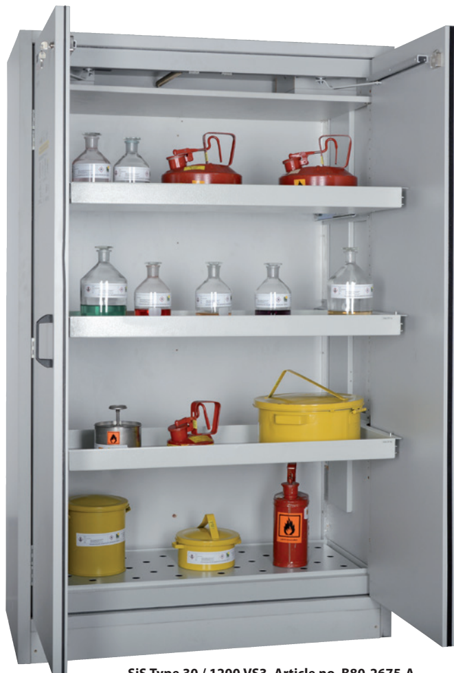
SiS Type 30 / 1200 VS3, Article no. B80-2675-A, doors RAL 7035 - light grey, incl. 3 pull-out shelves