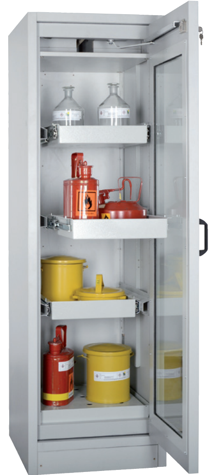
SiS Type 30 / 600 VS3 GL, Article no. B80-2663-A, door RAL 7035 - light grey, incl. 3 pull-out shelves