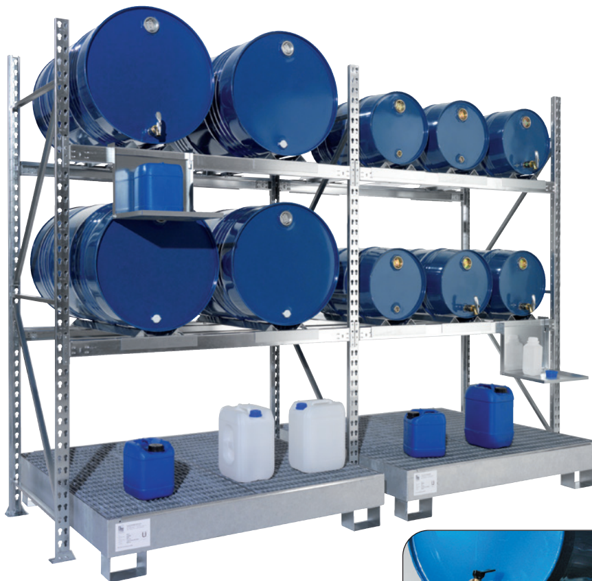
Rotating drum support, Article no. Z50-1925-B