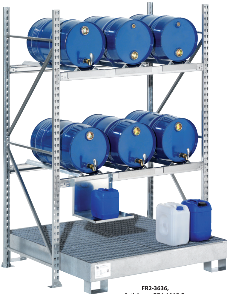
FR2-3636, Article no. R74-1015-B, with optional can support