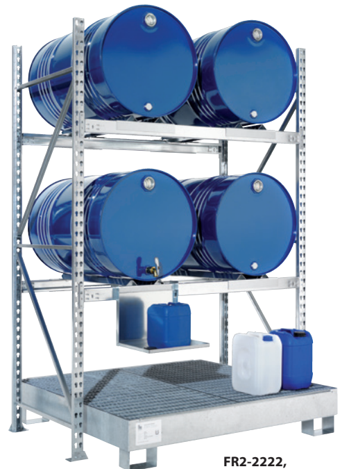
FR2-2222, Article no. R74-1007-B, with optional can support