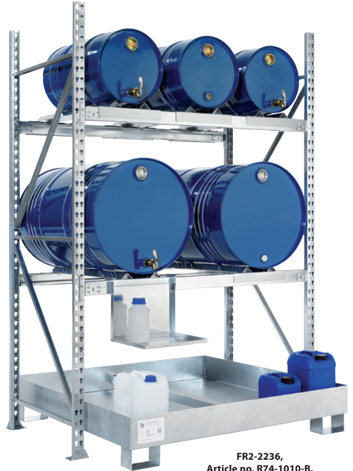
FR2-2236, Article no. R74-1010-B, with optional can support