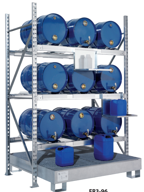
FR3-96, Article no. R74-1023-B, with optional can supports