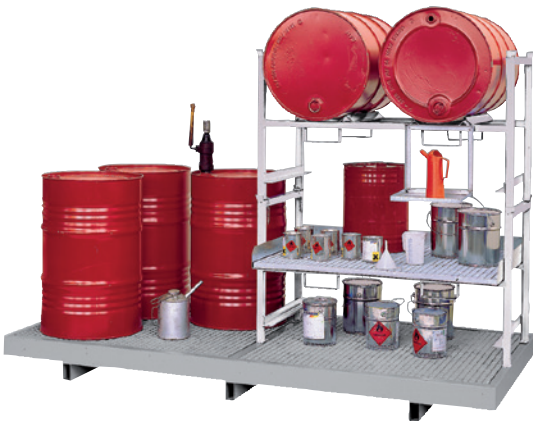
WSP-8-OS with 1 x STR-G and 1 x STR-2 stacking racks and can support