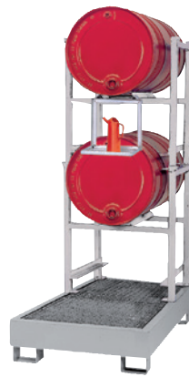
WSP-2-OS with 2 x STR-1 stacking racks and can support