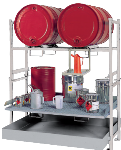
E2 with STR-2 + STR-G stacking racks and can support