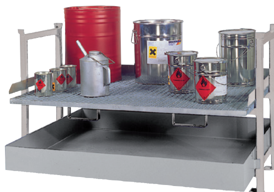
E2 with STR-G stacking rack