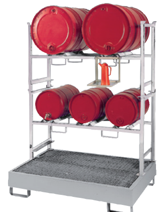
WSP-4-OS with STR-2+STR-3 stacking racks and can support