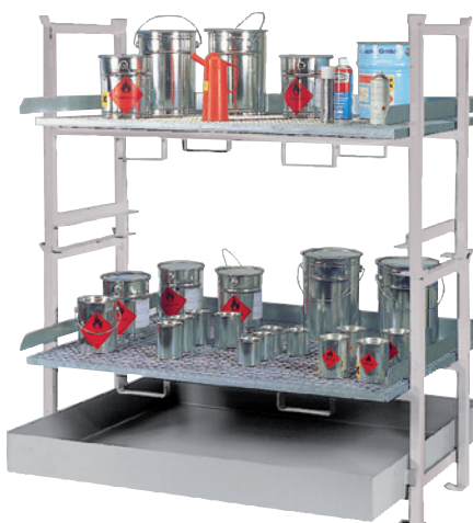
E2 with 2 x STR-G stacking racks