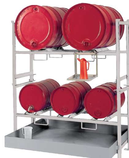
E2 with STR-2 + STR-3 stacking racks and can support