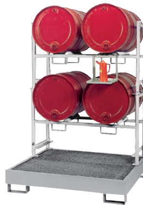
WSP-4-OS with 2 x STR-2 stacking racks and can support