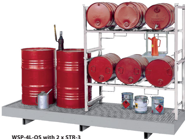
WSP-4L-OS with 2 x STR-3 stacking racks and can support