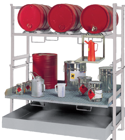
E2 with STR-3 + STR-G stacking racks and can support