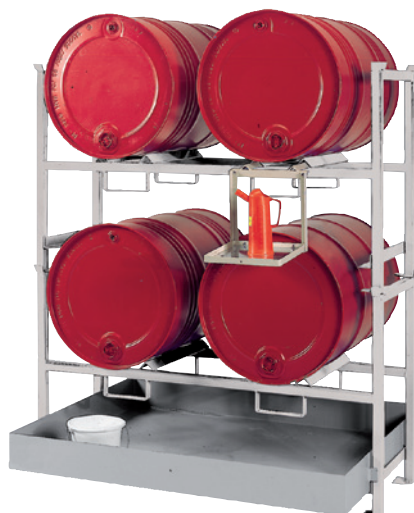
E2 with 2 x STR-2 stacking racks and can support