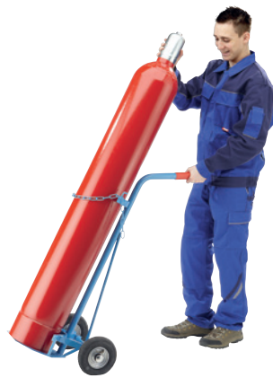
GFR40-L, Article no. B69-6431-A