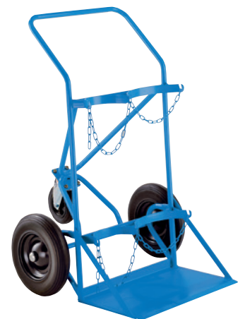
GFK2-VS, Article no. B69-6437-A