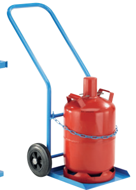
GFR27-V, Article no. B69-6433-A