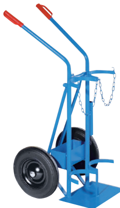
GFW50-VO, Article no. B69-6434-A