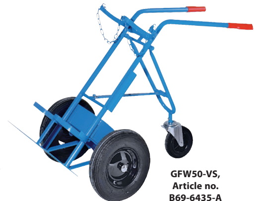
GFW50-VS, Article no. B69-6435-A