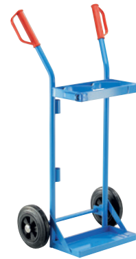
GFR10-V, Article no. B69-6432-A