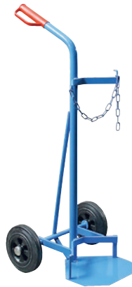
GFR40-V, Article no. B69-6430-A